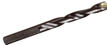
XA014C Carbide Tipped Pilot Drill