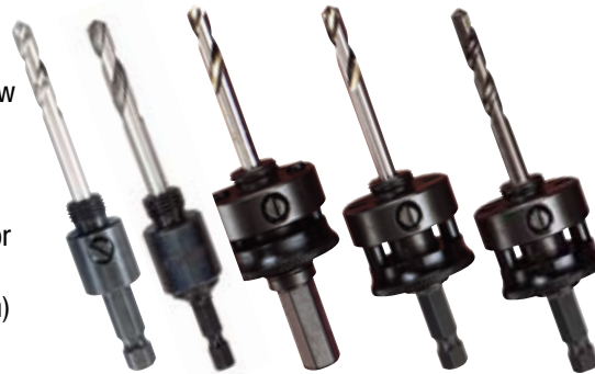
Left to Right: A1 A4 A2 Quick-Hitch A10 Quick-Hitch XA10 Quick-Hitch