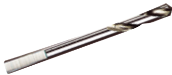
A014C HSS Pilot Drill