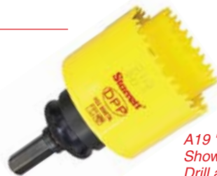
A19 "Oops" Arbor Shown with Pilot Drill and Hole Saw